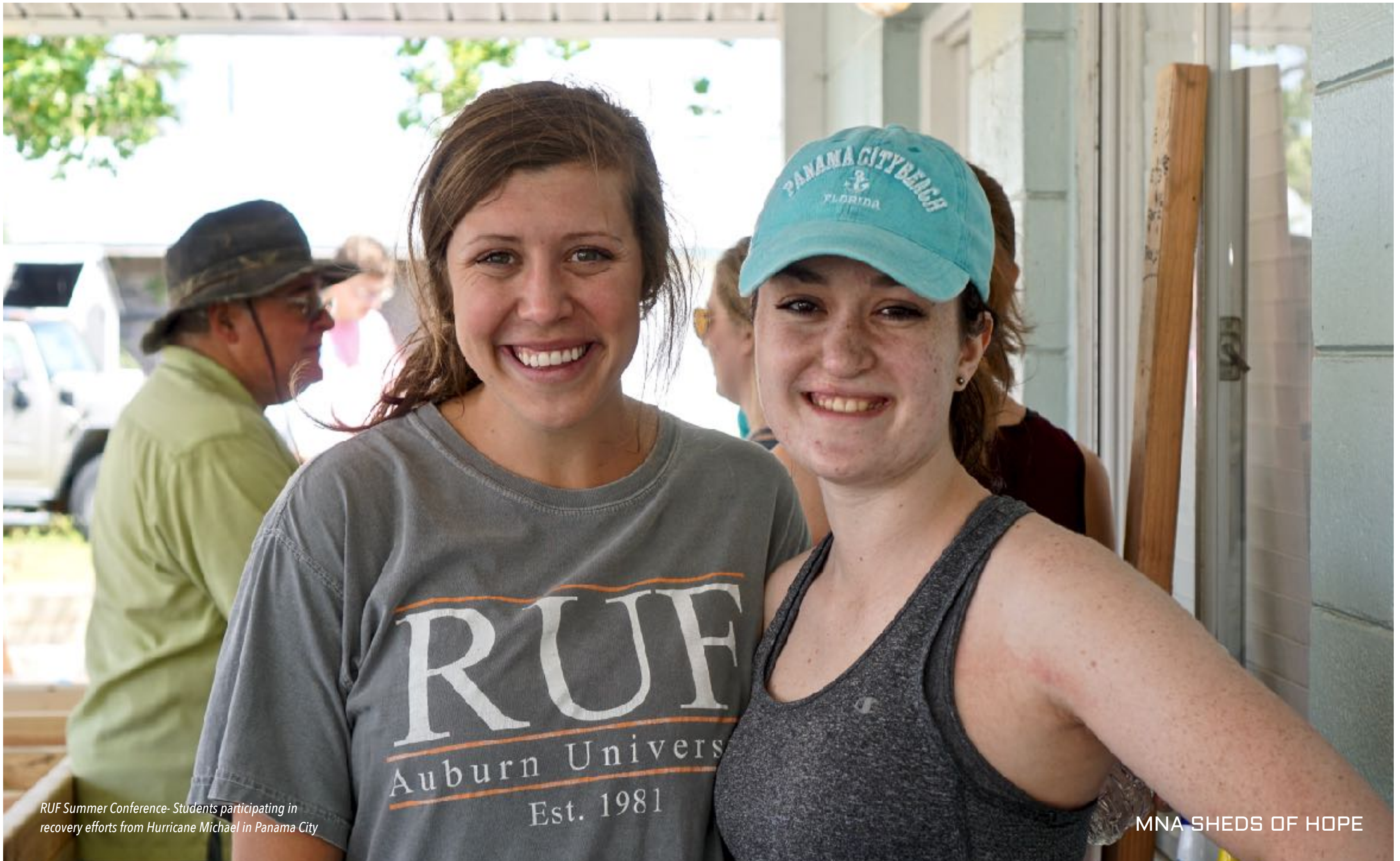
RUF Summer Conference- Students participating in recovery efforts from Hurricane Michael in Panama City