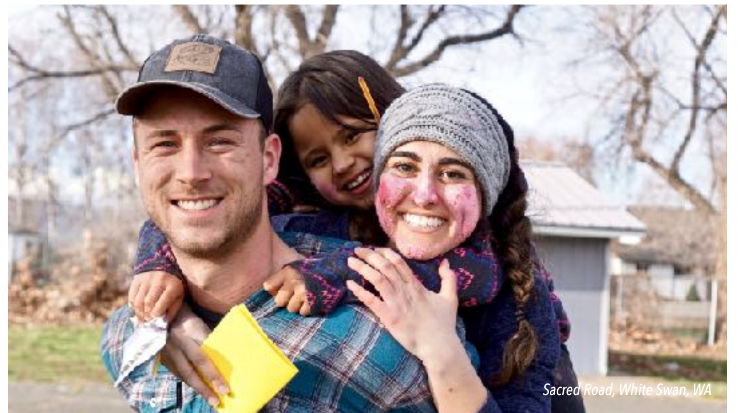
Sacred Road, White Swan, WA